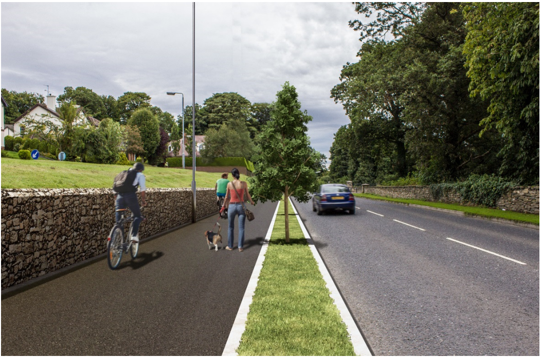
Current view – Culmore Road (A2) in Derry/Londonderry, near Larcom Drive.