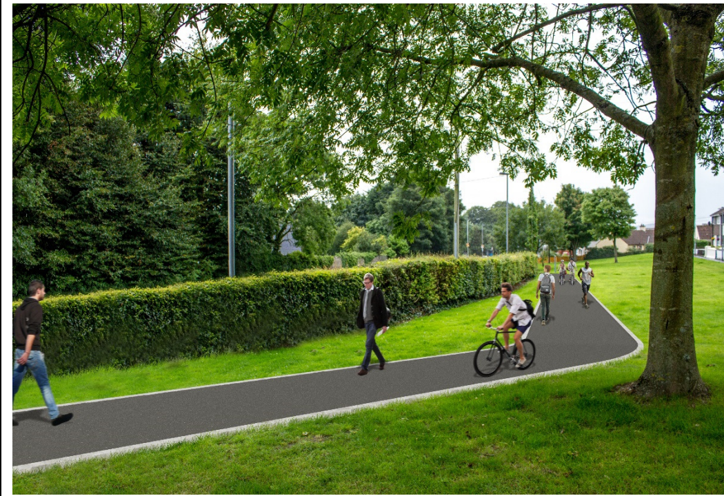
Current view – Culmore Road (A2) in Derry/Londonderry, at Ballynagard Crescent.