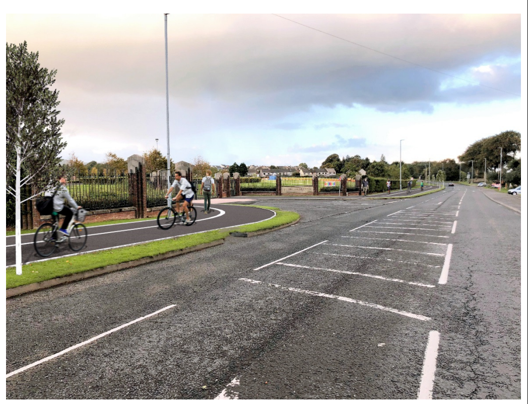
2022 – Thornhill College Showing the proposed new cycling and walking infrastructure.