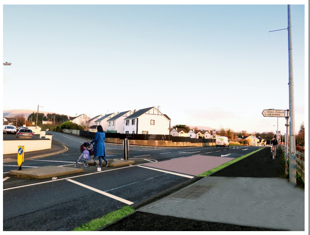
2022 –Muff ,showing the proposed new cycling and walking infrastructure.