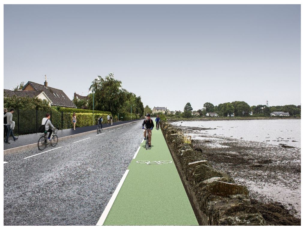
2022 – Culmore Point Road in Culmore, along the waterfront showing the proposed new cycling and walking infrastructure