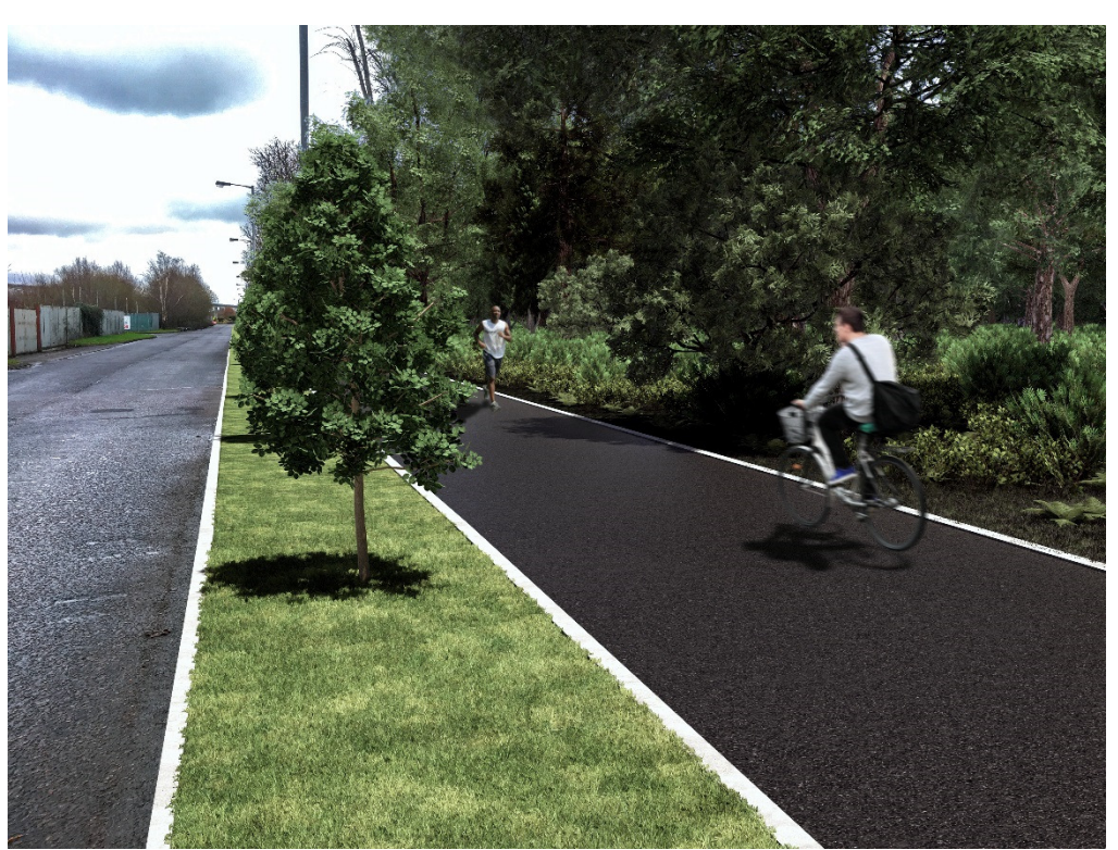
2022 – Bay Road , showing the proposed new cycling and walking infrastructure.