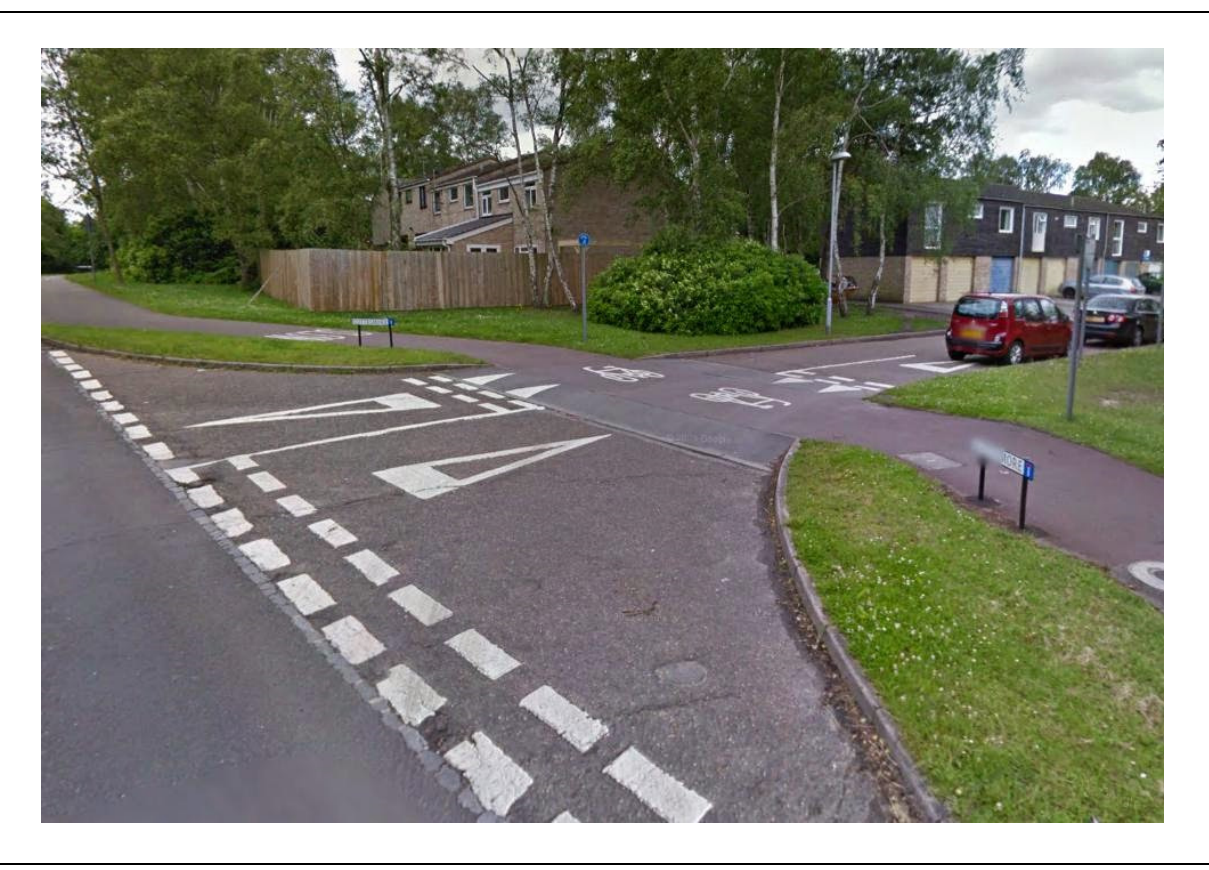
Proposed raised table crossings at junctions.